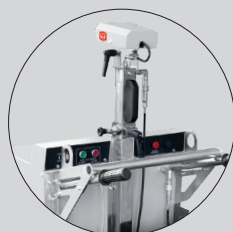
Manual Control panel